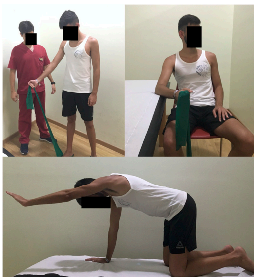
Figure 2. Performance of eccentric exercises for the supraspinatus.

Exercise for the supraspinatus: from standing position, the patient performed a shoulder abduction (concentric phase), followed by a slow shoulder adduction (eccentric phase). The patient used elastic bands to achieve proportional resistance. These were fixed to the floor using one foot (Figure 2).